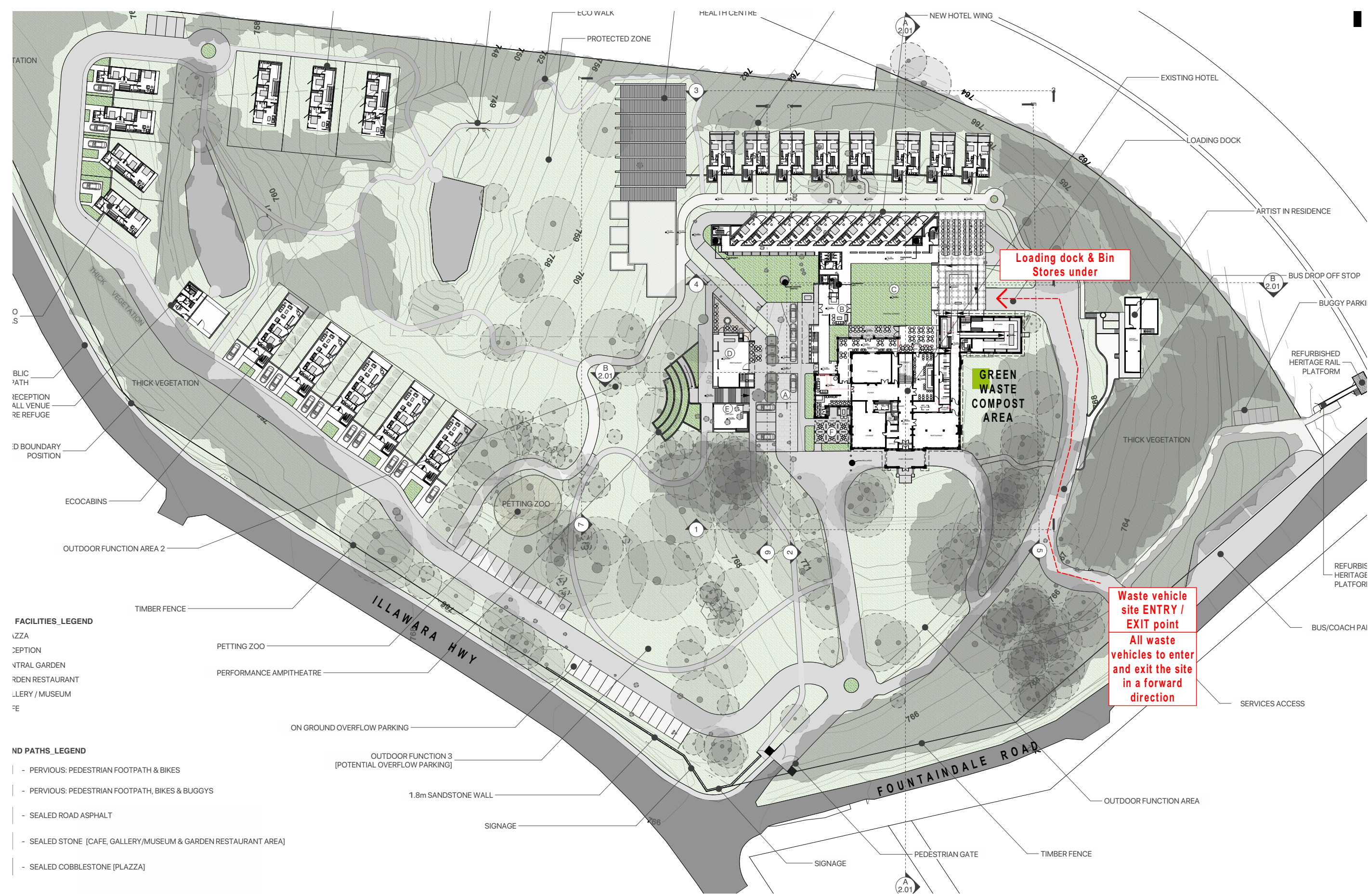
Site Plan Street Level nts